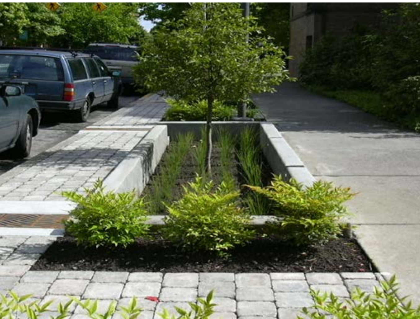
Planting beds dispersed through pedestrian and plaza areas.