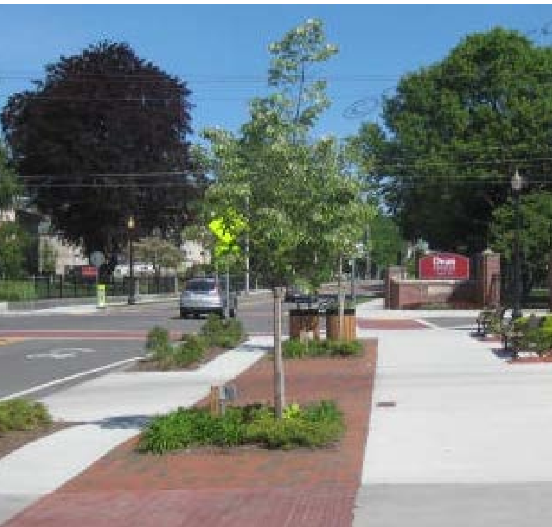
Paver banding utilized to separate cycle-track from pedestrian circulation and plaza areas.