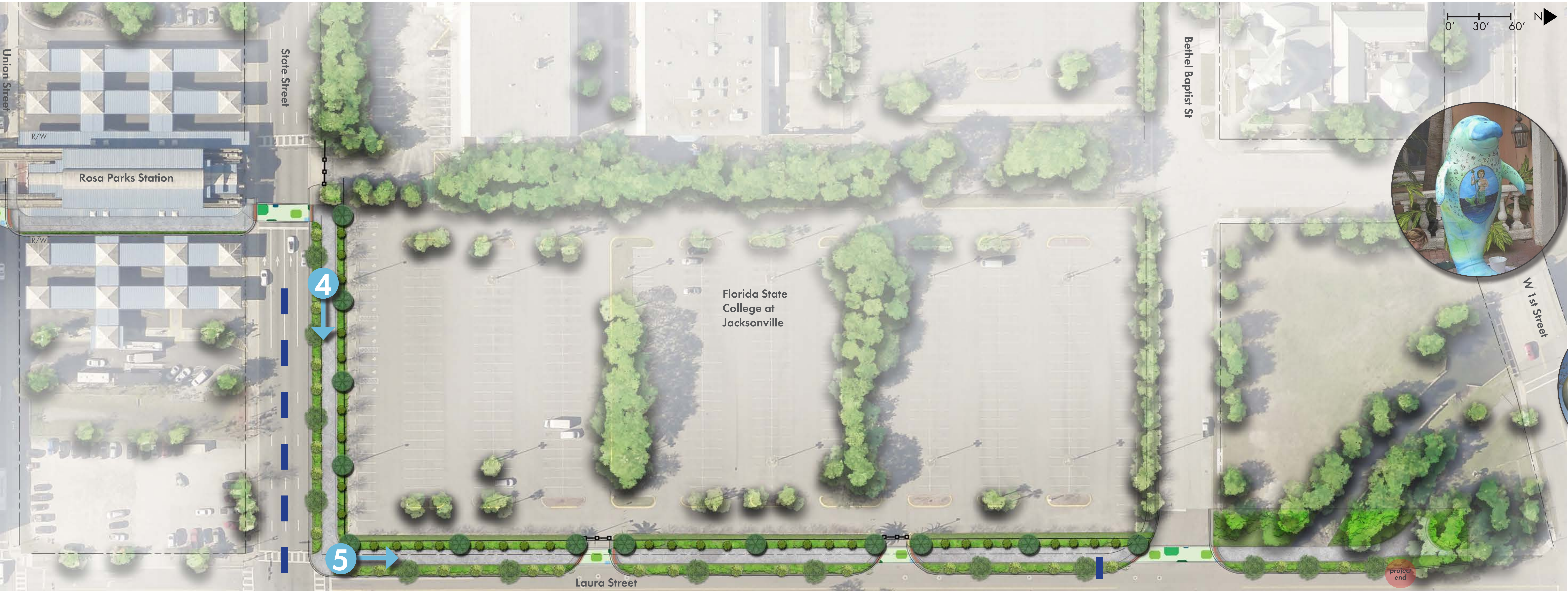
Typical F: State Street