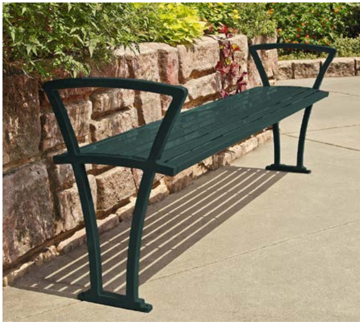
Benches to match site furnishings proposed on the Model Mile project.