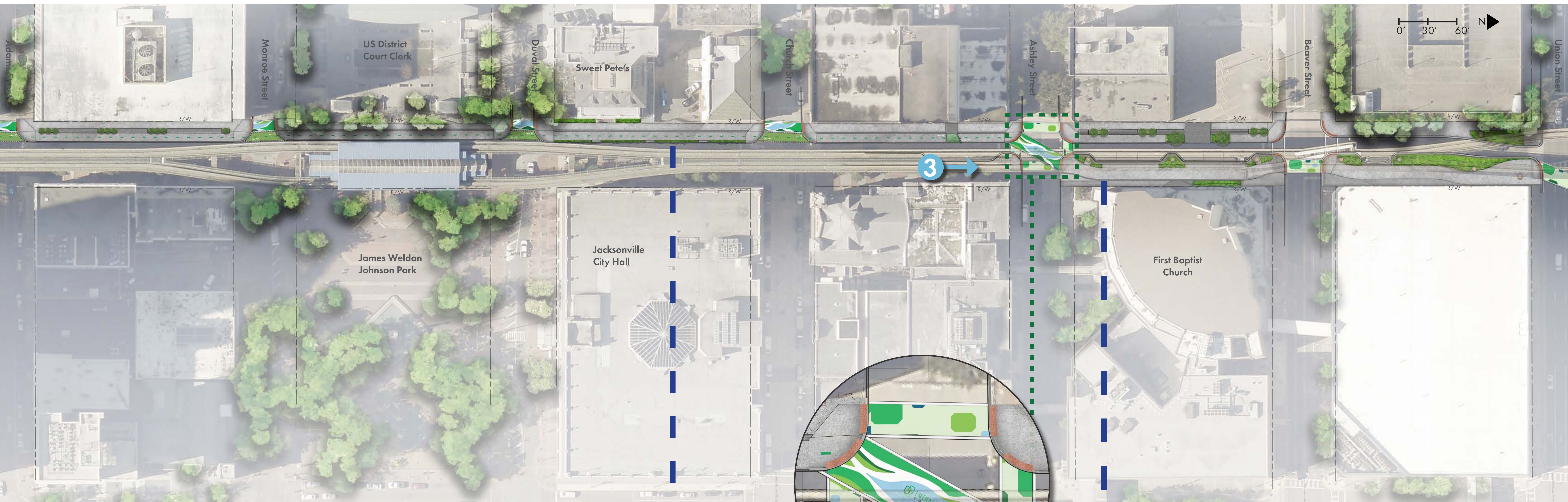
Typical C: Mountable Curb